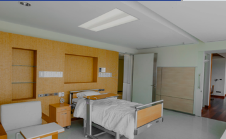
PATIENT/GUEST AMBIENT MODE 7:00 PM