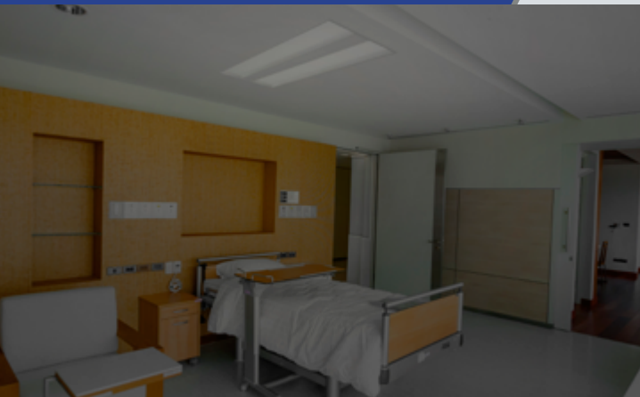
NIGHTTIME MODE 3:00 AM