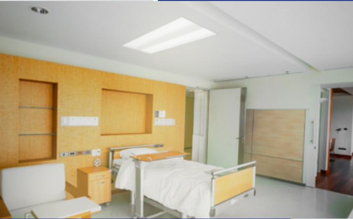
CAREGIVER EXAM MODE 10:00 AM